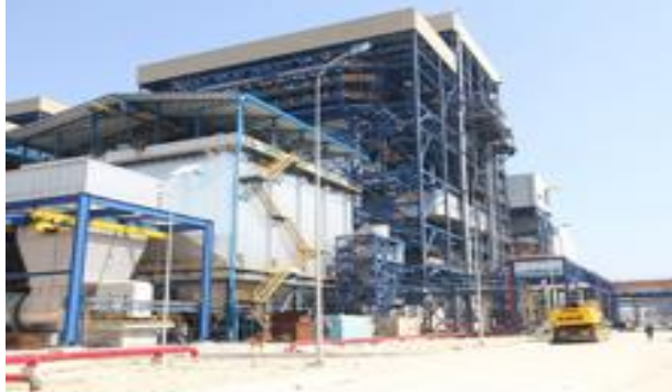
Vung Ang I Thermal Power Plant - Ha Tinh