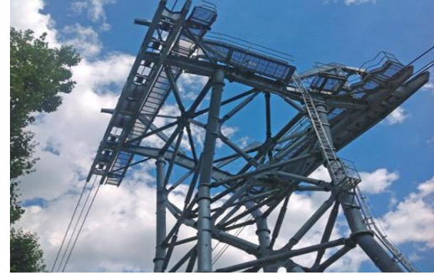
FANSIPAN Slings Project - SunGroup