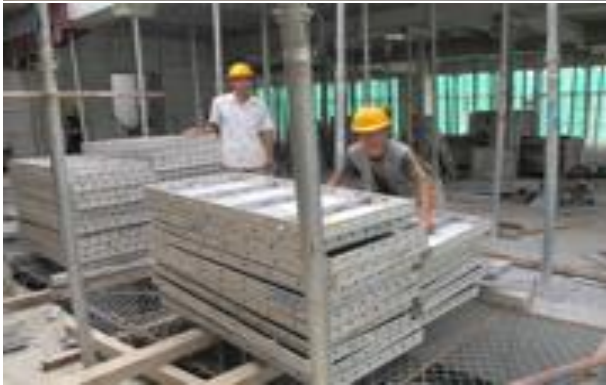
CT3 - Grandia Lanmak Tower - My Dinh